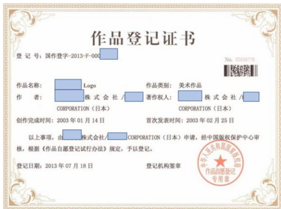
(A sample copyright registration certificate)

Originally created copyright works enjoy protection in China, via the Berne Convention, without the need for registration. China however also offers a voluntary copyright registration regime since 1994 and the number of copyright registrations has drastically increased in recent years.